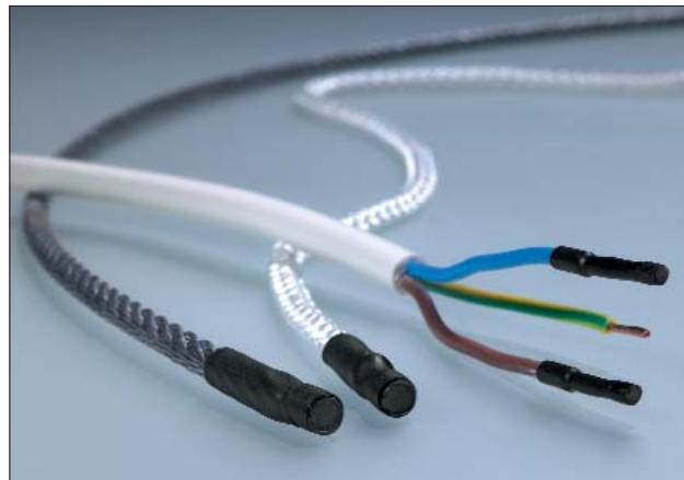
Due to the high shrink ratio the PEC-Series can be used for non-electrical applications as well.

Pinched End Caps can be used for mechanical and environmental protection of stub splices in electrical harnesses. Due to the fast and easy installation, these caps can be used for non-electrical applications as well.