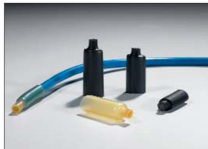
The mechanically tough jacket provides strain relief and abrasion protections for unused cables.