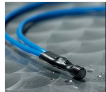
Pinched End Caps can be used for splices in electrical harnesses.